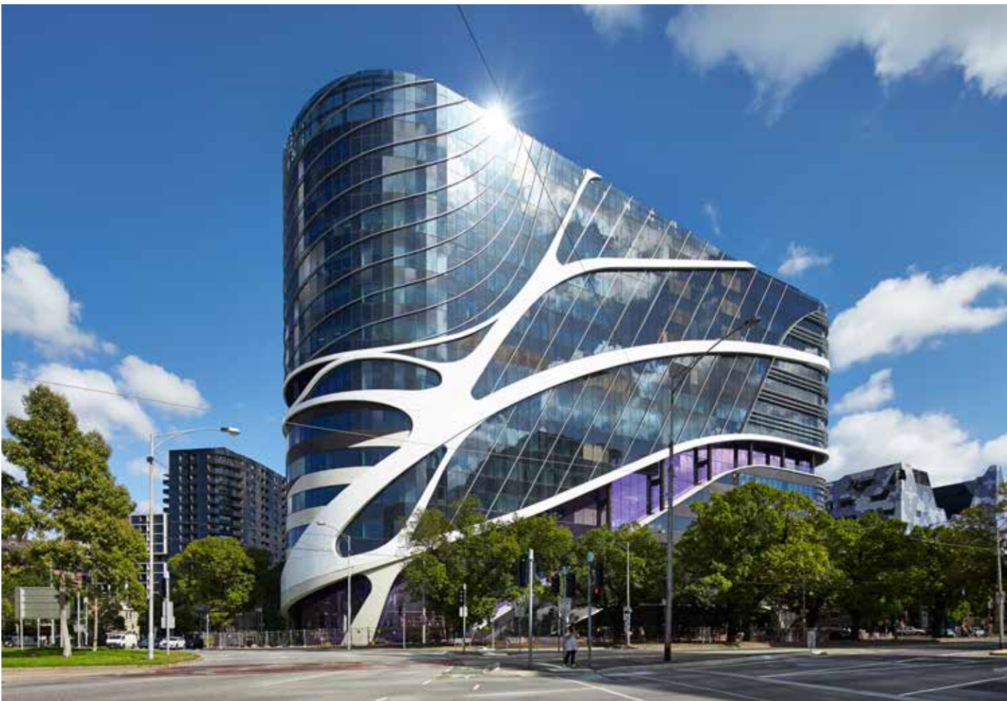
Victorian Comprehensive Cancer Centre