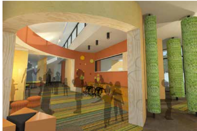
New schools PPP project (artist impression)