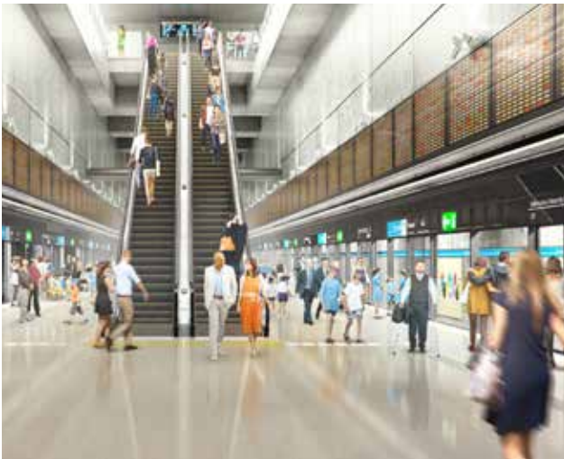
Melbourne Metro Rail Parkville Station (artist impression)

Any scope changes or cost movement against the PSC should be justified by a full value-for-money analysis. The scope ladder is evaluated as part of the net present cost risk adjusted cost of the proposals.