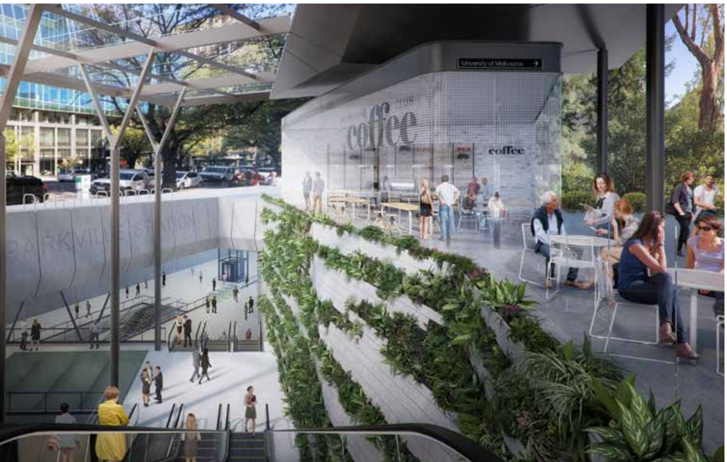
Melbourne Metro Rail Parkville Station (artist impression)

The discount rate methodology in the National PPP Guidelines is not appropriate for use in making the investment decision or applying to the cost benefit analysis.