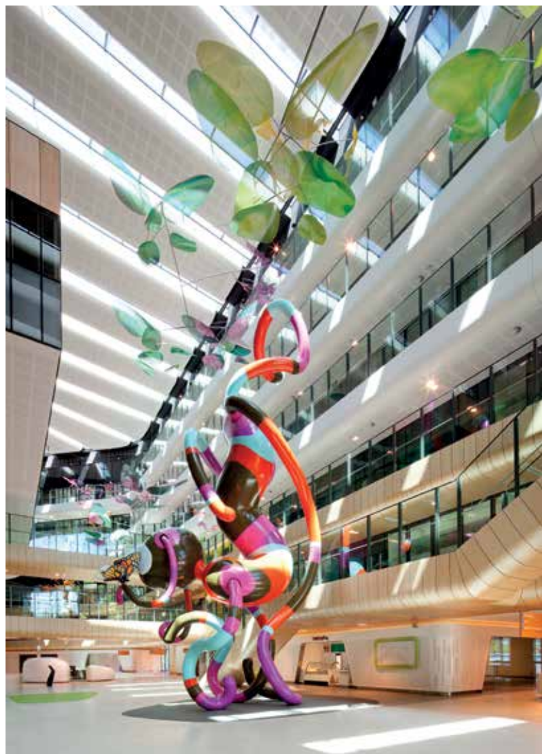
Royal Children's Hospital

DTF can advise procuring agencies on the form and content of each sign off. The project director will sign an overarching assurance and is responsible for coordinating the sign off process and providing copies to DTF.