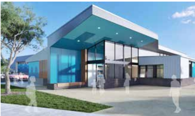
New schools PPP project (artist impression)

To the extent a refinancing results in a gain, the State's share in a PPP refinancing gain will be returned to the Consolidated Fund either as a lump sum or through a reduction to the ongoing quarterly service payments, and the procuring agency's financial estimates adjusted accordingly.