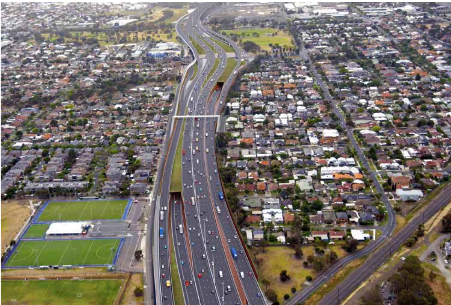
Western Distributor (artist impression)

Market-led proposals directly related to PPP contracts or that progress as PPP contracts must comply with the National PPP Guidelines and the Partnerships Victoria Requirements.