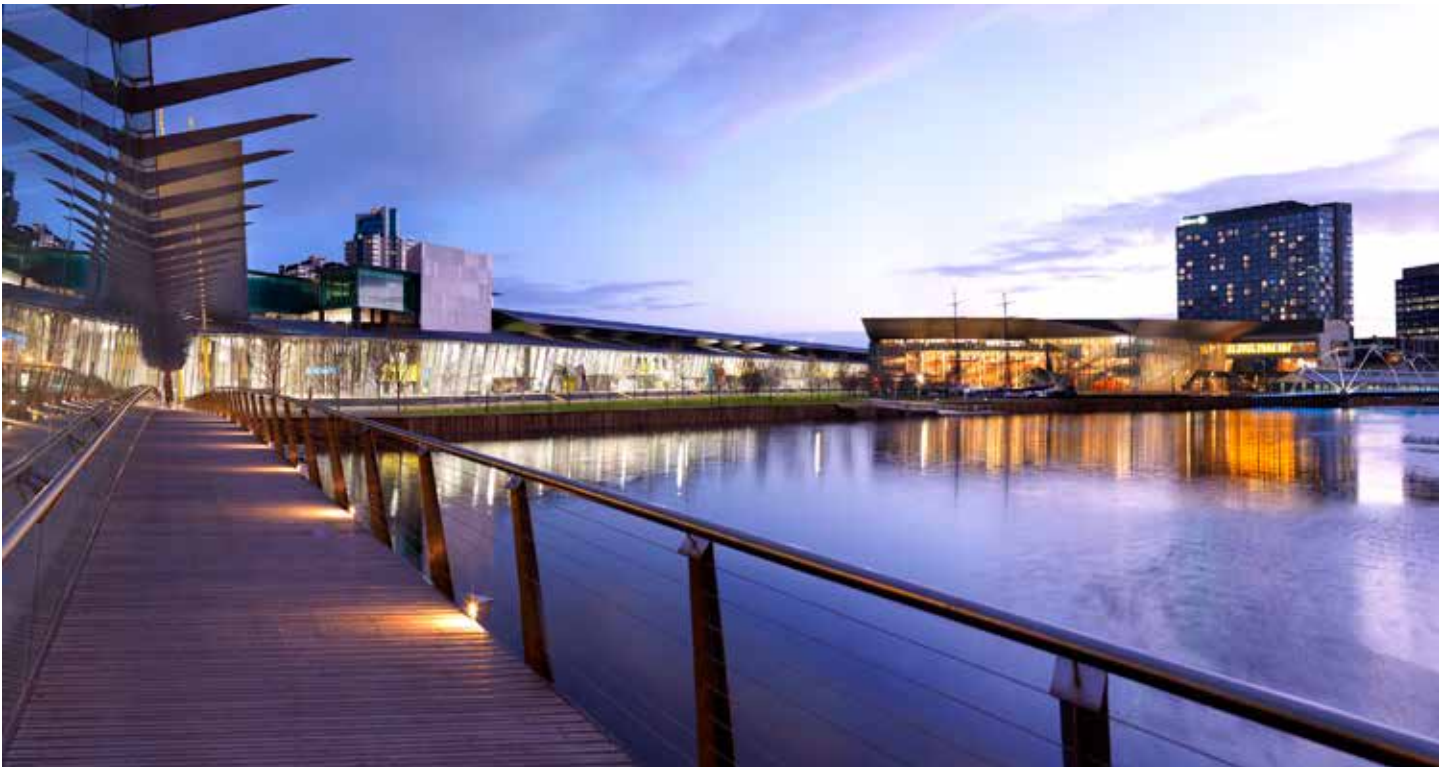
Melbourne Convention and Exhibition Centre

Additional Government approvals are required where there is: