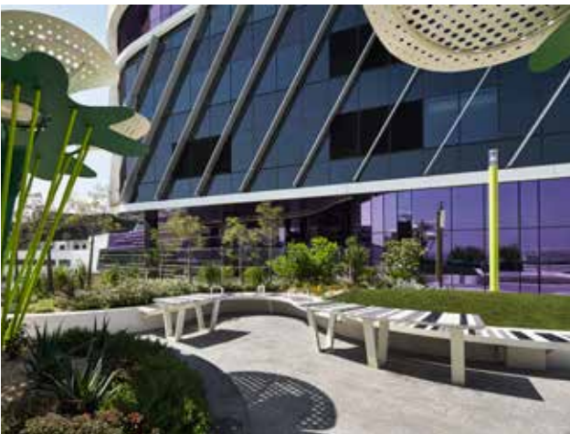
Victorian Comprehensive Cancer Centre

A public interest test template is available at www.partnerships.vic.gov.au . The public interest test is also published as part of the project summary.